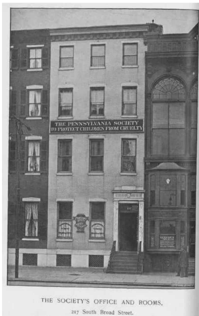
Offices of the Pennsylvania Society to Protect Children from Cruelty in the late nineteenth century.

I looked to investigate these contradictions through a historical analysis of administrative data. The field's definition of administrative data as data produced from service delivery, and as a product of computational enhancements and policy changes in the 1990s, enabled a political and strategic forgetting of "the archive." Importantly, this forgetting failed to acknowledge the fact that computational media are simulations of physical precedents. [6] What my reading here offers is a demonstration of how administrative data, the information powering data-driven governance today, is unique in its ability to simultaneously provide a valuation and represent children and families' social and cultural variables, through the cost and labor of services that produced the data collected. To contest the grounding assumptions for how we understand data and documentation today, [7] I turned to early child welfare annual report archives from 1877 to 1923 to better understand the precedents and historical trajectory of administrative data.